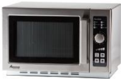
Model RCS10DSE shown